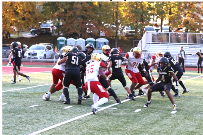
Things become very uncomfortable for opponents if they near the Crusader goal line.