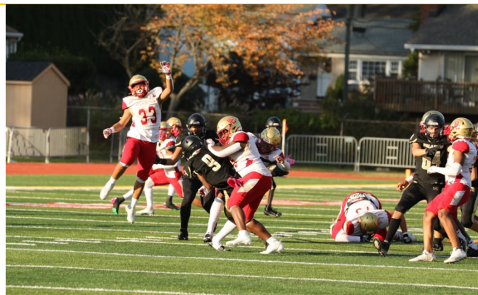
Above, least desired job in football---whoever is playing QB vs. BC.