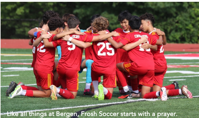
Like all things at Bergen, Frosh Soccer starts with a prayer.

SEPTEMBER 7 – ORADELL, NJ – Many have high hopes for this freshman class of soccer players. On Thursday at the Jack, we saw why. The newest Crusaders showed an ability to control the ball and in-turn, the game with a skill level most varsity teams cannot match.