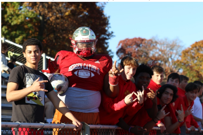
CRAZIES IN THE HOUSE! The Big Man and friends cheering on BC in its opening round of the State Tournament Soccer Game.