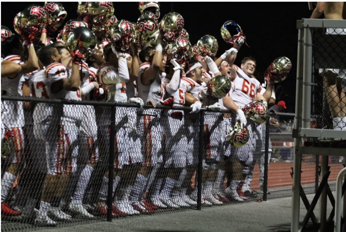
HEY! HEY! HEY! Nothing better than hearing the Alma Mater ( Lead On Bergen Catholic High ) sung by the team and the Crazies after each game!