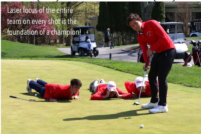
Laser focus of the entire team on every shot is the foundation of a champion!

May 3 – Rockleigh, NJ – The Bergen County Golf Course at Rockleigh was the site of the most recent Crusader golf victory. Bergen's score of 152, edged St. Joseph Regional's 153. Third place was Don Bosco Prep (167), followed by DePaul Catholic (170) and Paramus Catholic (209).